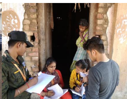
Survey during Residential camp