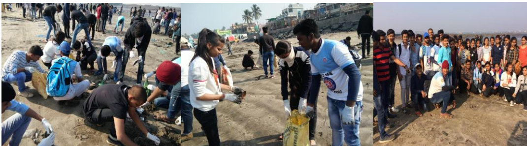
Gorai Beach Cleaning