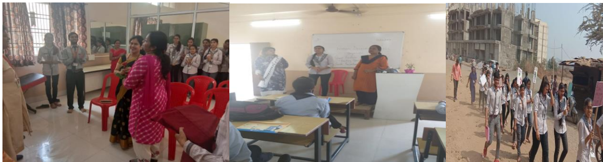
Spa & Wellness opening under WDC

For self grooming up of the students, special beauty advisory session of 40 hours is started in the month of March, 2019.