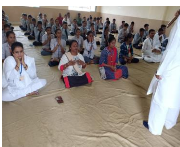
Yoga Day Celebration

In order to achieve these objectives NSS unit has conducted activities like Yoga Day, Tree Plantation Drive, Blood Donation Camp, Bhajan Sandhya, Provided assistance during Ganapati Visarjan, Ground Cleaning, and Rally on save water, Street play on Plastic ban, etc.