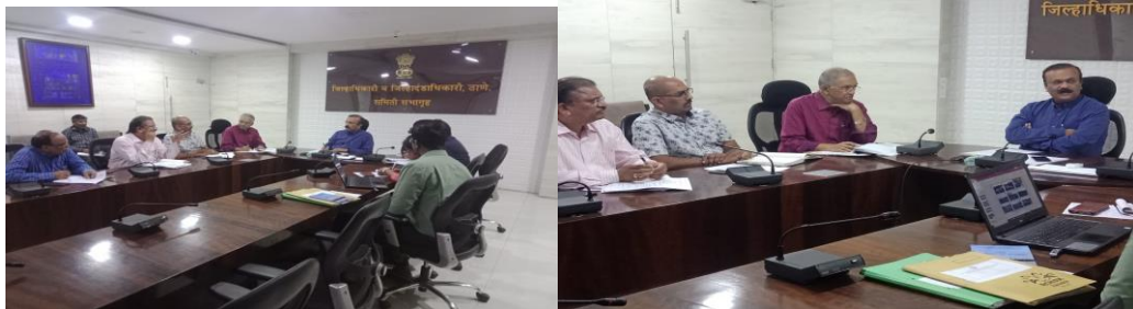
MoU with BNCMC