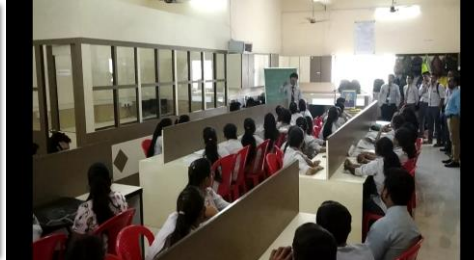
Vachan Prerna Day