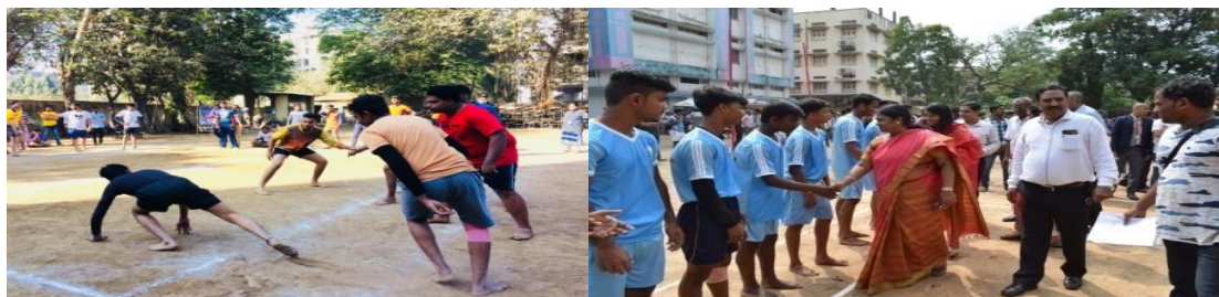
Universty Level inter collegiate Kabaddi tournament