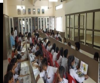
News Paper Clipping