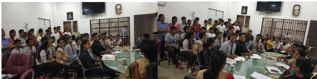
Meeting with Student Council

In the month of July meeting with Student council conducted where roles and responsibilities assigned to each Teacher, CR and head of Student council in order to develop Mentor Mentee relationship. A ratio of 1:10 was formed where one head assigned the responsibilities of 10 students and that head will communicate with teachers in order to encourage self learning through peer group and self development. Class Teachers were assigned to each class for fixing the responsibility of maintaining class records and to ensure discipline among the students.