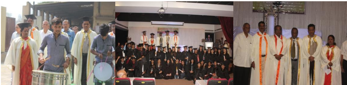
Annual Degree Distribution