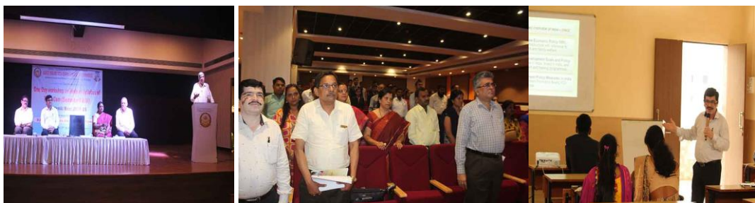
Workshop on Revised Workshop