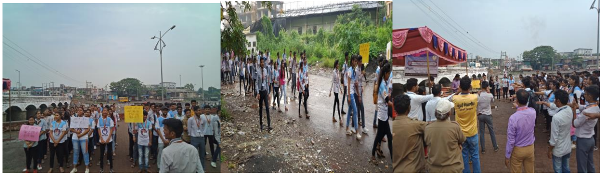
Ganga Peace March