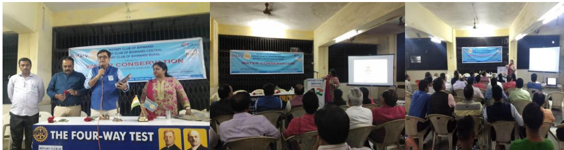
Rotary Club Meeting