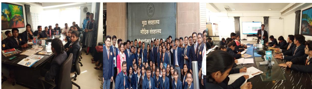
Visit to BSE & RBI Monetary Museum

To provide students practical exposure to industries, one day Visit to BSE and RBI Monetary Museum were arranged on 26 th February, 2019. Total 51 students and two faculties have visited and gained the experience of Bombay stock exchange functioning.