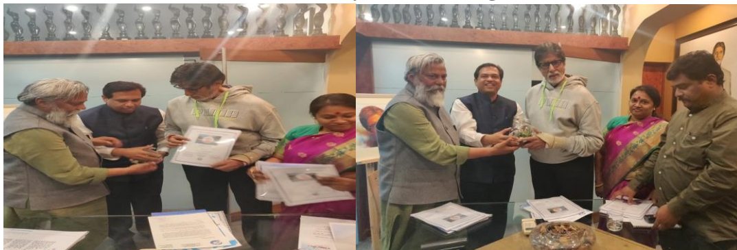
Meeting with Amitabh Bachchan for Ganga River Rejuvenation