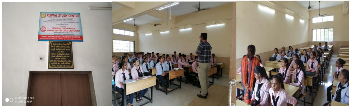
YCMOU Centre Inauguration