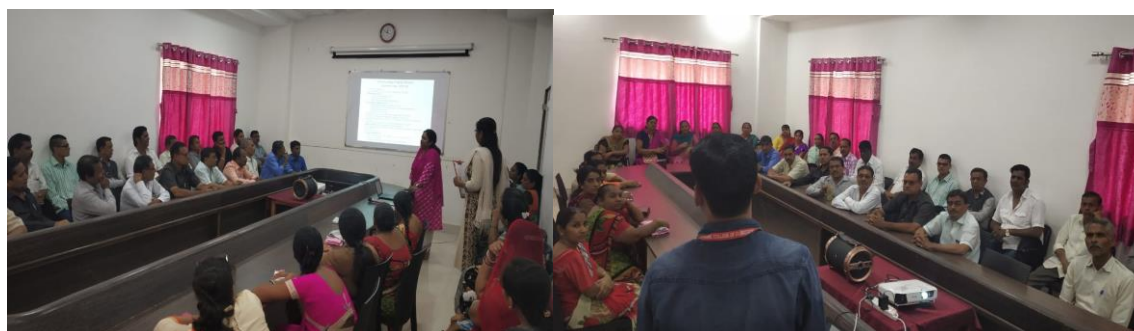
Meeting with parents

Parents' meeting was conducted on 25 th September, 2018 to make parents aware about the courses & progress made by the college in the form of infrastructure, Student's progress & new courses initiated. Courses like M.Com and MBA of YCMOU and IGNOU were started in the year and parents are encouraged for enrolment of their wards especially those are graduates during the year. Attendance of students and infrastructural development in the college during NAAC accreditation process and further conduct of Dhanak and UDAN festival and conferences and students role of leadership and dealing in conflicting situation in managing the events.