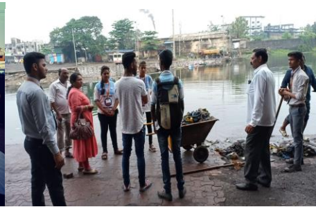
Kamvari River Cleaning