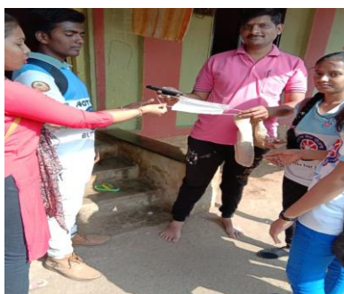
Anti Plastic Campaign Student Council