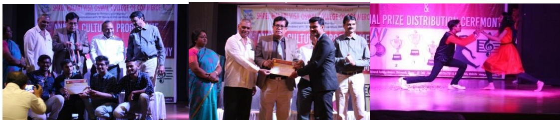
Annual Day Celebration

The activities are conducted by Student Council are Freshers party, Guru Purnima, Teachers day, Navratri day, Black and white day, Traditional Day annual day and prize distribution, farewell to TYBCOM students, etc,